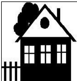
ACC issues guidelines for new residences. Page 3.