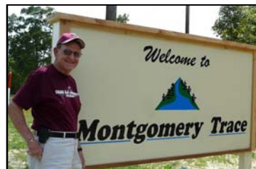
Fishcreek Thoroughfare gets new entrance signs. Page 4.