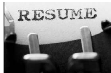
Director resumes for Sections 1, 3, 5, 7, and 9 begin on page 7.